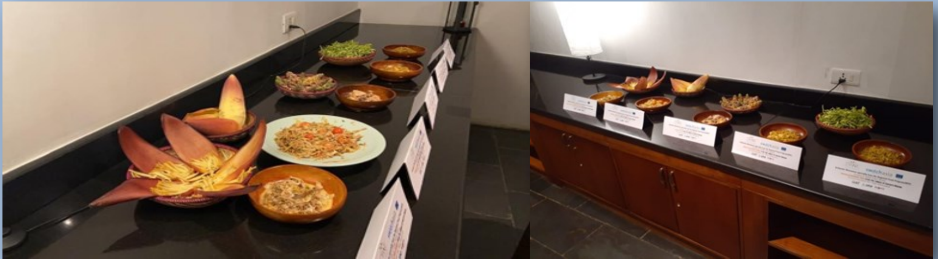
Displayed Raw Flowers and its's Dishes

The SHINE Team had a very timely and honourable opportunity to invite the EU delegation to experience the Regional Food Program on 19th September, 2022 at Hotel Zhiwaling Ascent, Thimphu. The group consisted of Members of Parliament, Secretariat South Asia Delegation, Political group staff, EU Delegation to India and Bhutan, and UN Heads of Agencies, and they were on an official visit to Bhutan. The dinner menu was designed to highlight the authentic way of Bhutanese cuisine with the freshly organized ingredients from eastern districts, such as papaya flower, banana flower and orchid. The raw ingredients - flower blossoms and shell were displayed together with the handicraft products of east, especially from Trashie Yangtse and Zhemgang. Different types of plates and utensils made of wood and bamboo cane were used